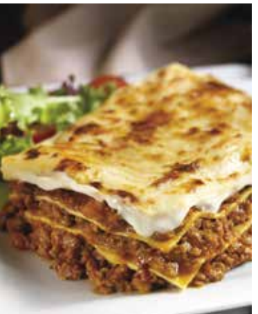
641030 Beef Lasagne