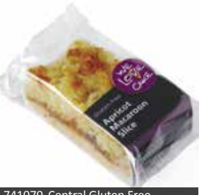
741070 Central Gluten Free Apricot Macaroon 72gm (2.5oz)